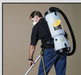
Meets EPA RRP Rule