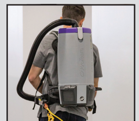
Multiple Uses for Many Applications