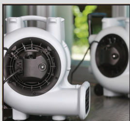
Carpets & Subfloors